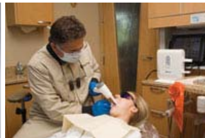
Figure 2. VELscope in clinical use.