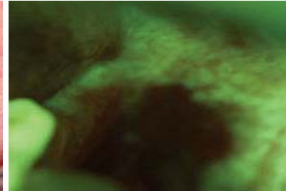
Figure 6. Figure 5 as seen under the VELscope. Dark area is VELscope-positive, which was confirmed by biopsy as carcinoma in situ.

The department of Oral Medicine at the University of Washington has, for the past several years, conducted an Oral Dysplasia Clinic that is housed within the Head and Neck Cancer Clinic at the University of Washington Medical Center. It is a regional center that accepts referrals from a 5-state region. The Oral Dysplasia Clinic receives referrals from physicians and dentists treating patients with oral lesions that have or appear to have potential for progression into SCC. The purpose of the clinic is to manage such patients and to follow them periodically to determine if mucosal changes have undergone transformation to aggressive or malignant disease.