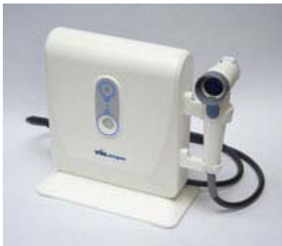
Figure 1. The VELscope unit.