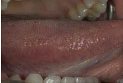
Figure 3. Image of normal tongue.