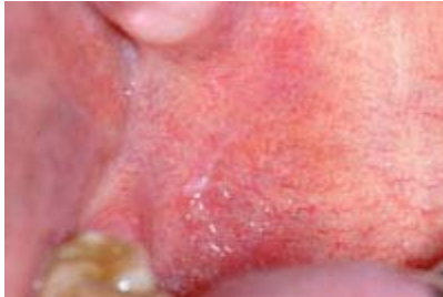
Figure 5. Area appearing normal under white light.